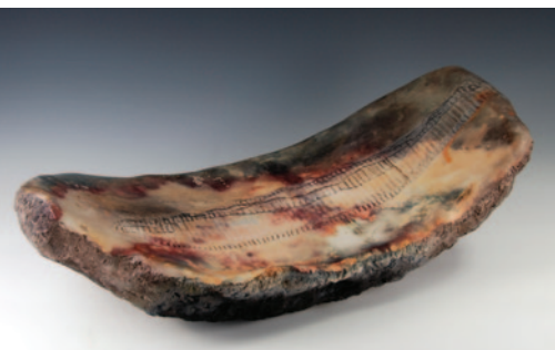
Top: Linda Sormin with the three sculptures she coil built in open lattice form using a porcelain paper clay recipe. Lehatsit – Ignite ; composed of a dove, a boat, a cave were glazed and electric fired to cone 6. Centre: Michal Klasovsky works to develop a method of silkscreen printing underglaze colours onto leather hard clay. Above: Hilda Merom. Untitled . Slab built stoneware, pit fired. 6 x 30 x 12 in.

using Rani Gilat's method. Ettie Spindel did naked raku, Michal Klasovsky worked on a new silkscreen print technique, Dori Zanger combined Chinese underglaze decals with her own underglaze painted patterns. Pit firing, porcelain high fire, reduction and low fire were accomplished in the studio kilns. The Israeli-mixed clays were unique, beautiful, varied in colour and their rocky texture. All supplies were abundant in the studio. Porcelains were brought in from Europe. Hatch and I fell in love with French Limoges.